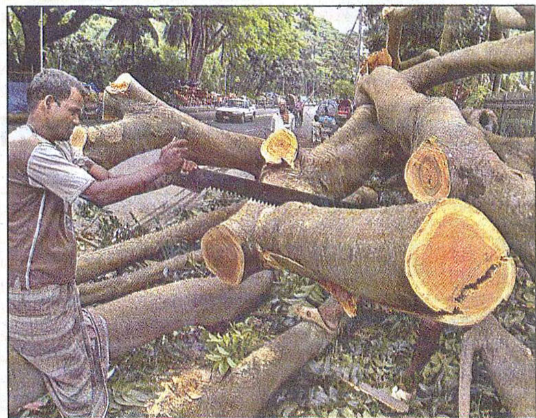
Dhaka City Corporation workers cut a fallen tree into shorter pieces to remove it from the footpath near the Curzon Hall on the Dhaka University campus yesterday. The tree was uprooted by a storm on Monday night.

In the first phase, two floors of the three-storied building will be constructed, the officials said