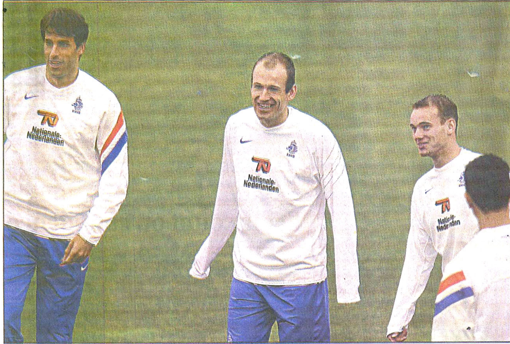
Members of the Dutch national team Ruud van Nistelrooy (L), Arjen Robben (C) and Wesley Sneijder (R) take part in a training session in Katwijk on Tuesday.