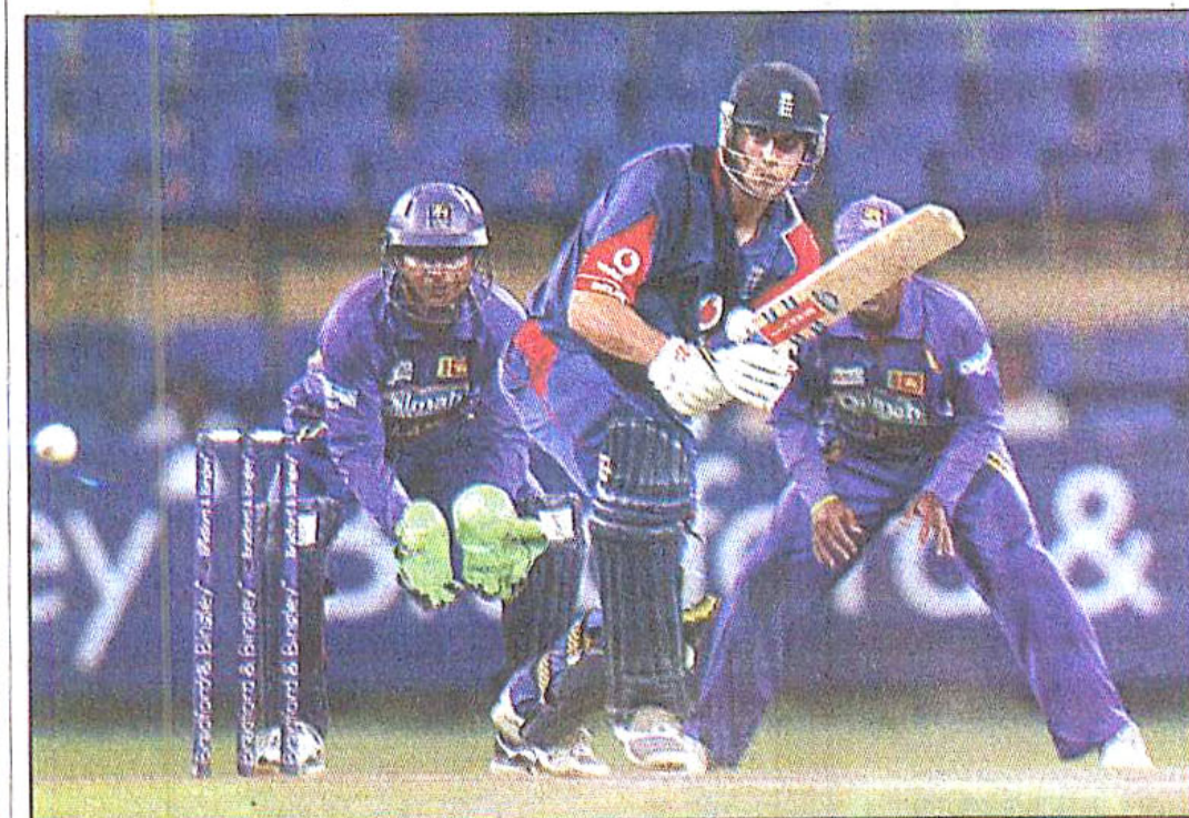
England opener Alastair Cook works the ball towards mid-wicket during the fourth one-day international against Sri Lanka at the R Premadasa Stadium in Colombo on Wednesday.