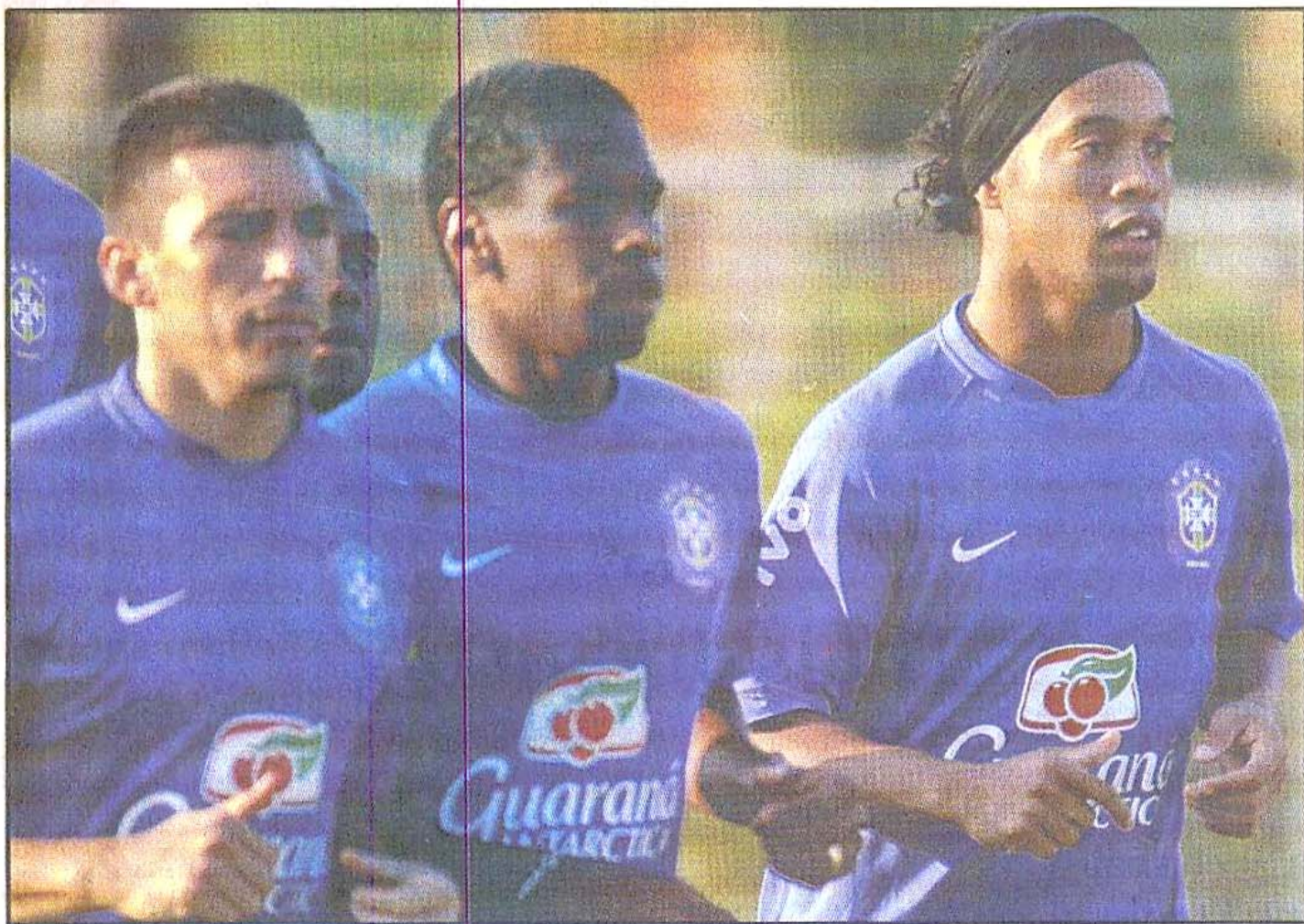
Brazil stars (from L-R) Lucio, Juan and Ronaldinho jog during a training exercise in Teresopolis, Rio de Janeiro on Tuesday.