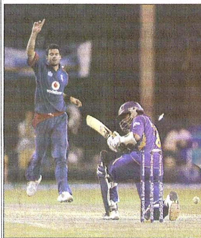
SCOOP GONE WRONG: England fast bowler James Anderson (L) celebrates after knocking over Sri Lanka batsman Tillakaratne Dilshan during the fourth one-day international at the R Premadasa Stadium in Colombo on Wednesday.