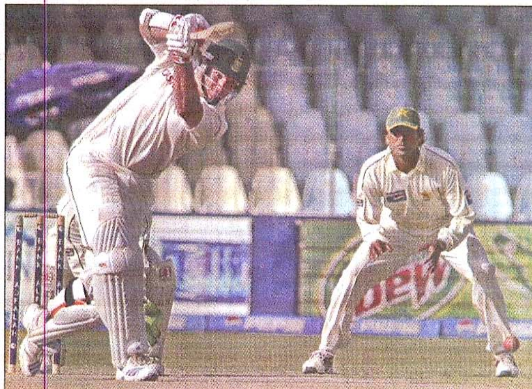
South Africa captain Graeme Smith drives the ball past the bowler during the third day of the second Test against Pakistan at the Gaddafi Stadium in Lahore on Wednesday.