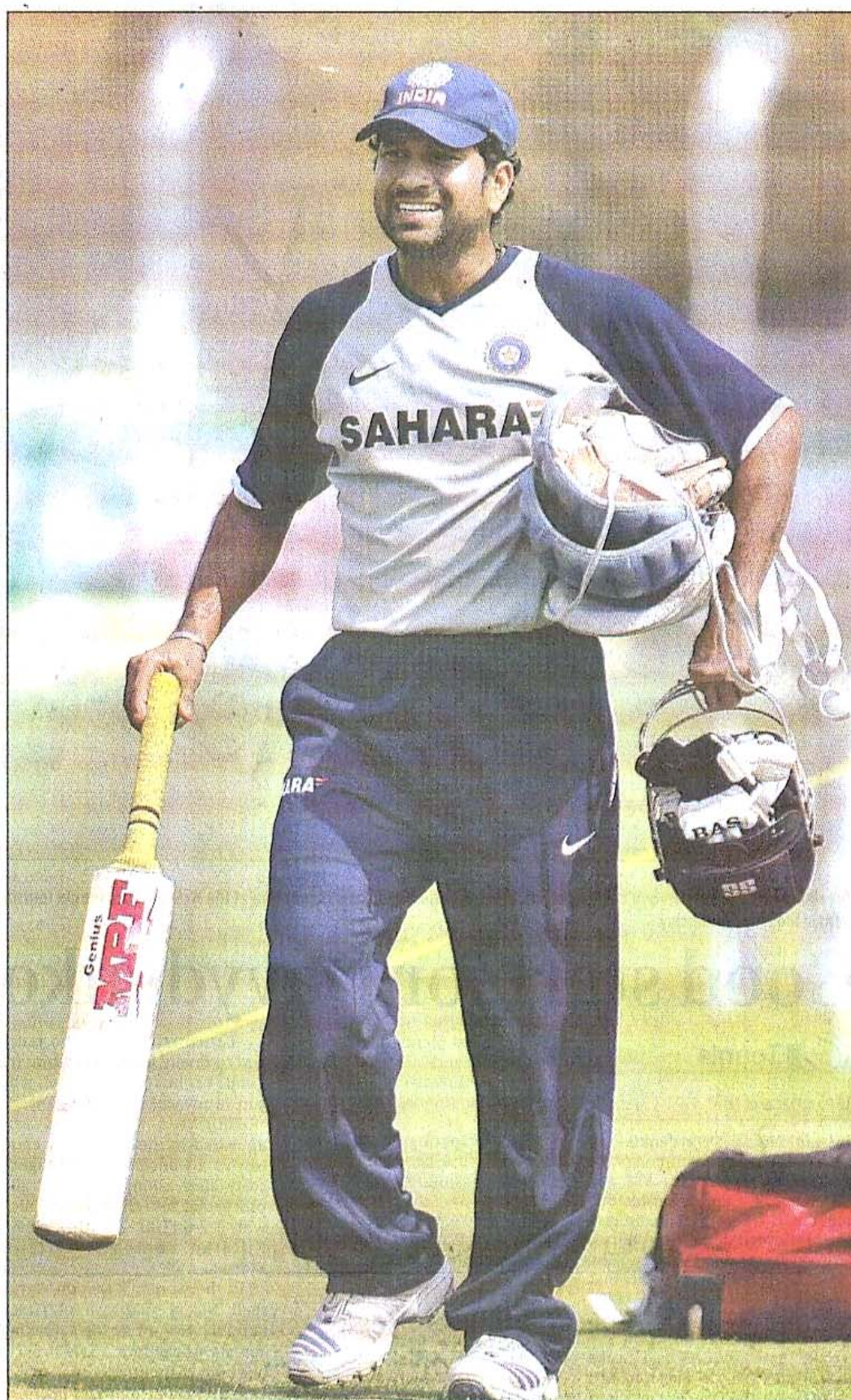
GEARING UP FOR THE BIG ONE: Sachin Tendulkar enters the practice area of the Reliance Cricket Stadium in Vadodra on Wednesday with his batting gear on the eve of the fifth one-day international against Australia.