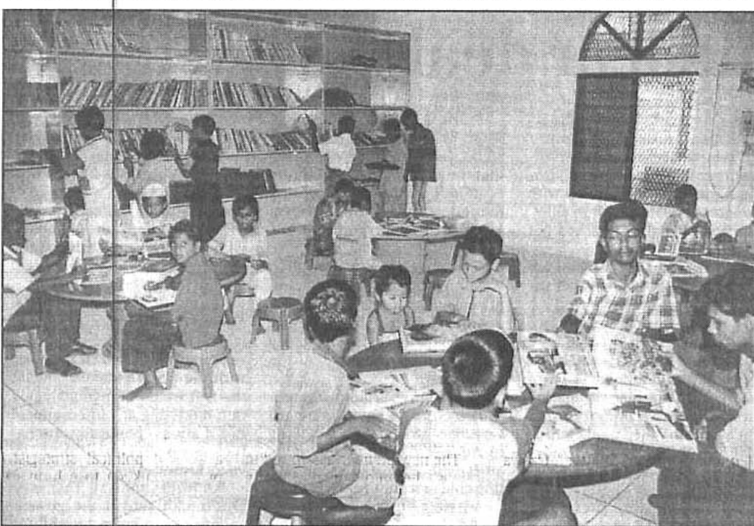
THE JOY OF LEARNING: Youngsters immersed in reading at the library at Rahmatpur village in Khoksha upazila.

Later, police framed charges against the three persons for misappropriation of government materials.