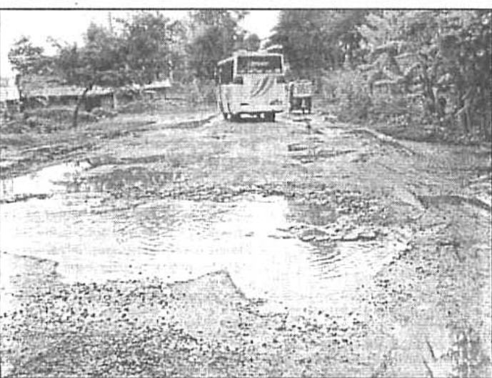
A large pothole on Chittagong-Cox's Bazar highway in Satkania remains a nuisance for tourists and commuters.

However, income tax officials believe about two thirds of defaulters are yet to disclose their undisclosed money. Action will be taken against them soon, they said.