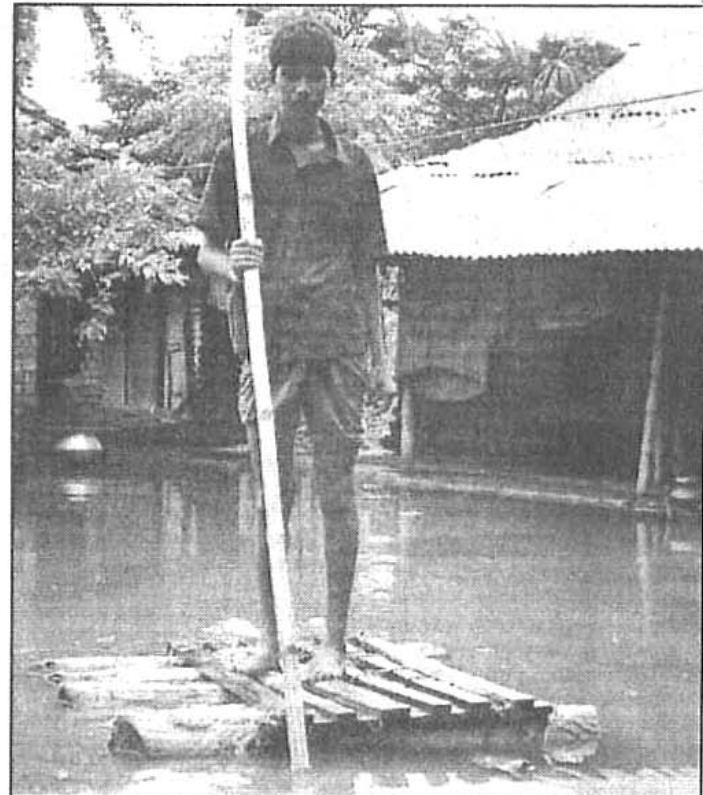
A boy uses a raft for movement from his waterlogged house at Kashipur village in Tala upazila in Sathkira district.