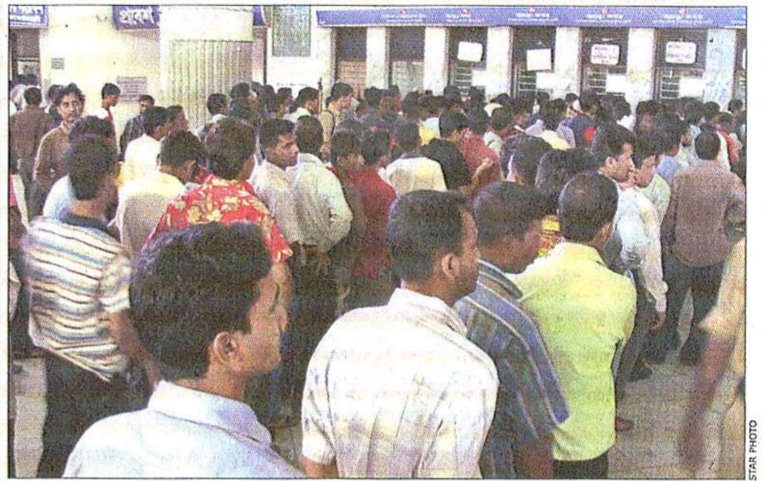
People wait in long queues for advance tickets at Chittagong Railway Station.

Besides, the authorities have allowed around 20,000 hawkers to do business on the footpath again at different city points offering a scope for thousands of lower middle class and lower class for Eid shopping.