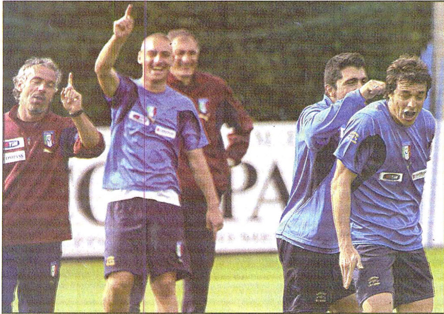
Italy midfielder Gennaro Gattuso (2nd R) pulls a prank on teammate Massimo Oddo (R) which is greeted with laughs from coach Roberto Donadoni (L) and Daniele de Rossi during a training session at the National Technical Center in Florence on Tuesday.