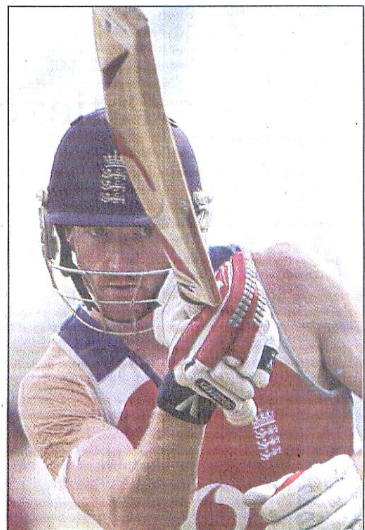
GIVING IT HIS ALL: England captain Paul Collingwood puts weight on his right shoulder as he bats in the nets at the R Premadasa Stadium in Colombo on Tuesday.