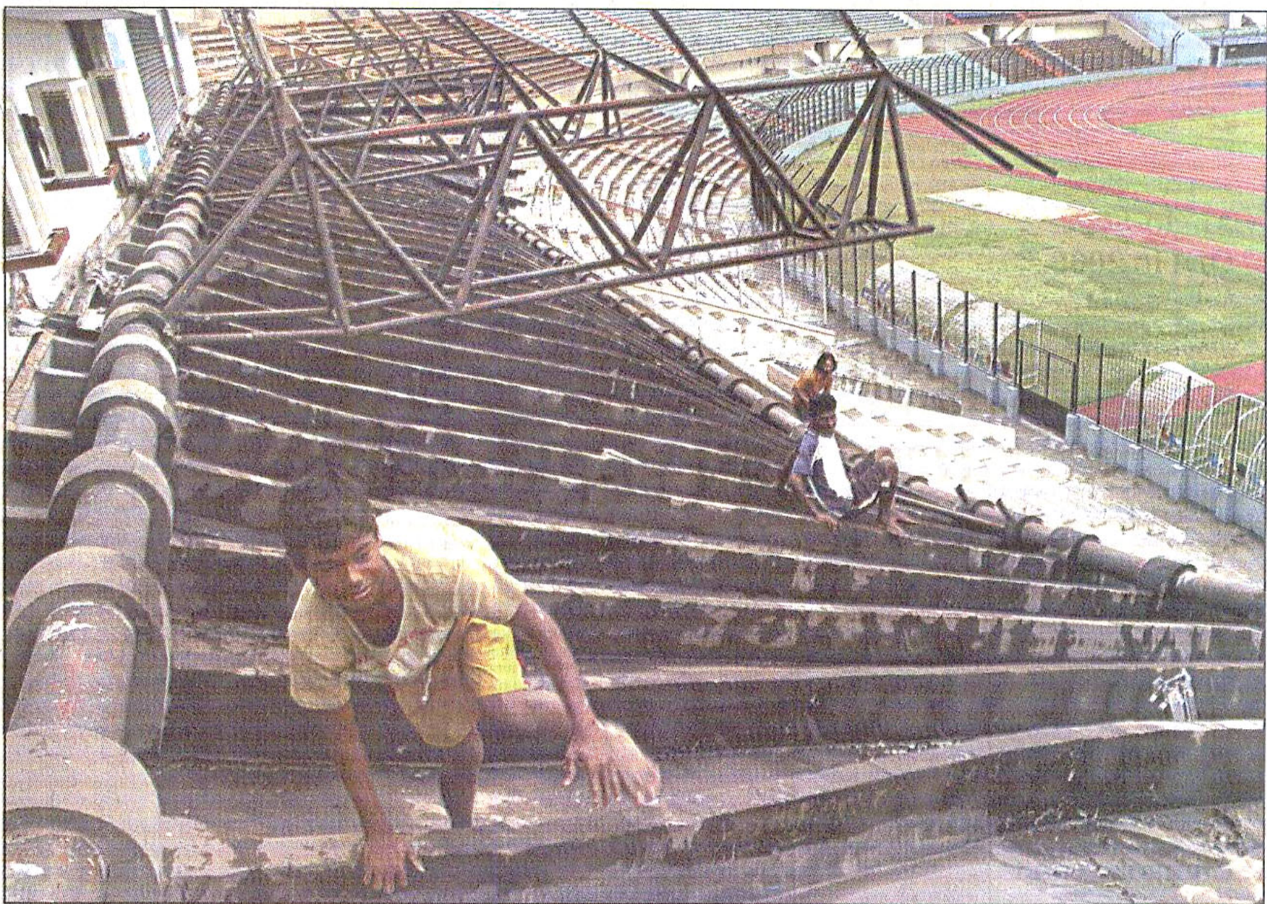
IMAGINE HAD IT COLLAPSED A FEW HOURS AGO: A street urchin playfully walks on the collapsed roof of the press box at the Bangabandhu National Stadium yesterday. Thankfully the roof fell a couple of hours after the World Cup pre-qualifying match between Bangladesh and Tajikistan on Monday night, avoiding a possible human disaster.