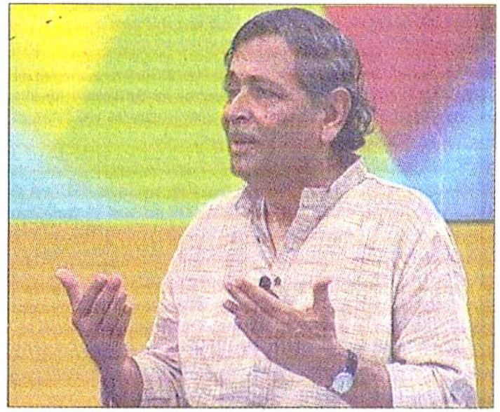
Professor Abdullah Abu Sayeed in Baroari