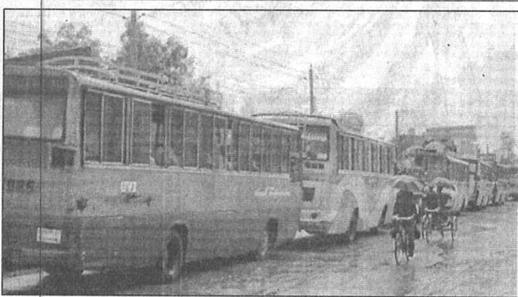
With vehicles getting stuck in a three-kilometre-long gridlock at Shepur on Dhaka-Bogra highway, the passengers had to undergo an unpleasant 'waiting test' yesterday.