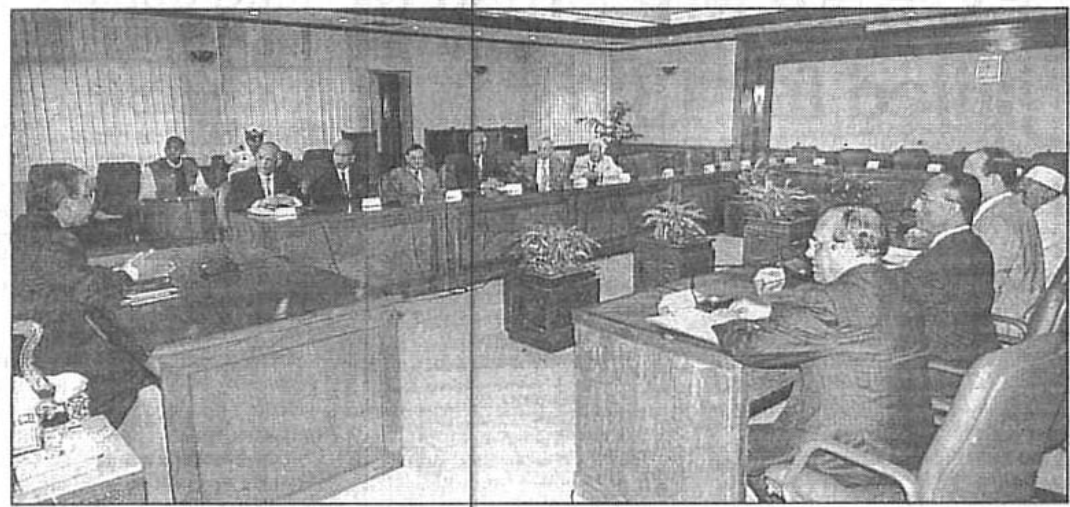
A delegation of Bangladesh Bar Council calls on Chief Adviser Fakhruddin Ahmed at the latter's office in the city yesterday. (Story on Page 1)

On economics, he said the government and concerned key government officials should adopt caution prior to take any important decision that may adversely affect the economy.