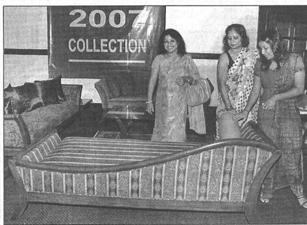
Visitors are seen at the launching ceremony of newly designed furniture made by Jalal Furniture Company Ltd in Dhaka yesterday.

Earlier on Sunday, a four-member committee was formed to probe into the tragic death of three persons of a family who died in a train accident at Phulbari gate rail crossing in Khulna city on last Saturday.