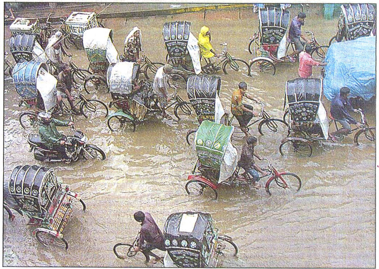
Many areas of Chittagong go under water due to torrential rain yesterday. The picture was taken at Kapasgola in the port city.

The examination will begin at 9:00am everyday. Details schedule and other examination related information would be available at the National University website- www.nu.edu.bd .