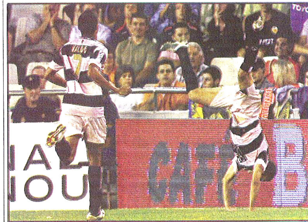
CIRCUS SHOW: Espanyol striker Luis Garcia (R) performs a somersault after scoring a late winner against Valencia at the Mestalla on Saturday.