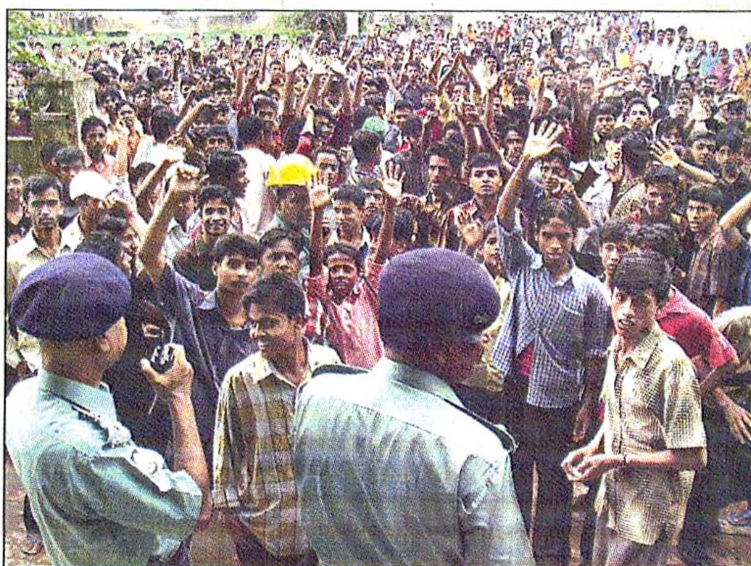
Workers of Bandar Knitting Ltd. stage a demonstration in the Chittagong EPZ area yesterday following a rumour that a fellow worker died due to torture by factory owners.