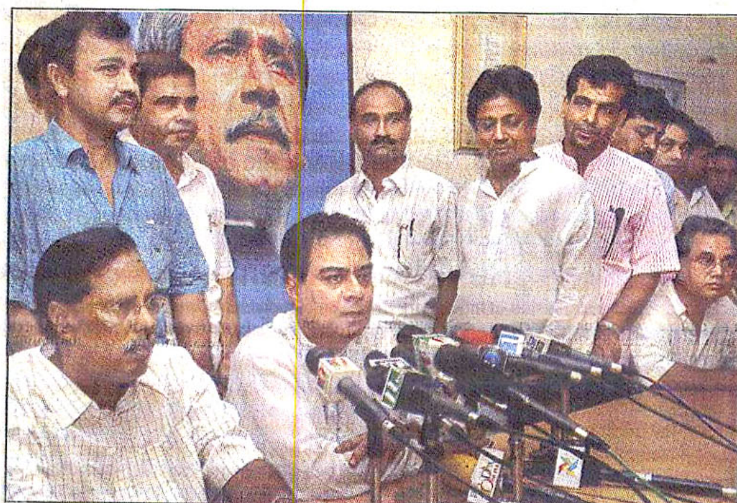
New acting general secretary of Awami League Syed Ashrafur Islam talks to reporters at the party's Dhanmondi office in the city yesterday.

"The outlets will start functioning after Eid-ul-Fitr," the Home Ministry official added.