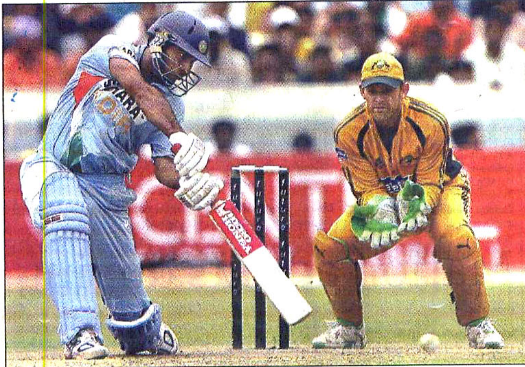
Yuvraj Singh smacks the ball through extra-cover during India's chase against Australia in the third one-day international at the Rajiv Gandhi International Stadium in Hyderabad on Friday.