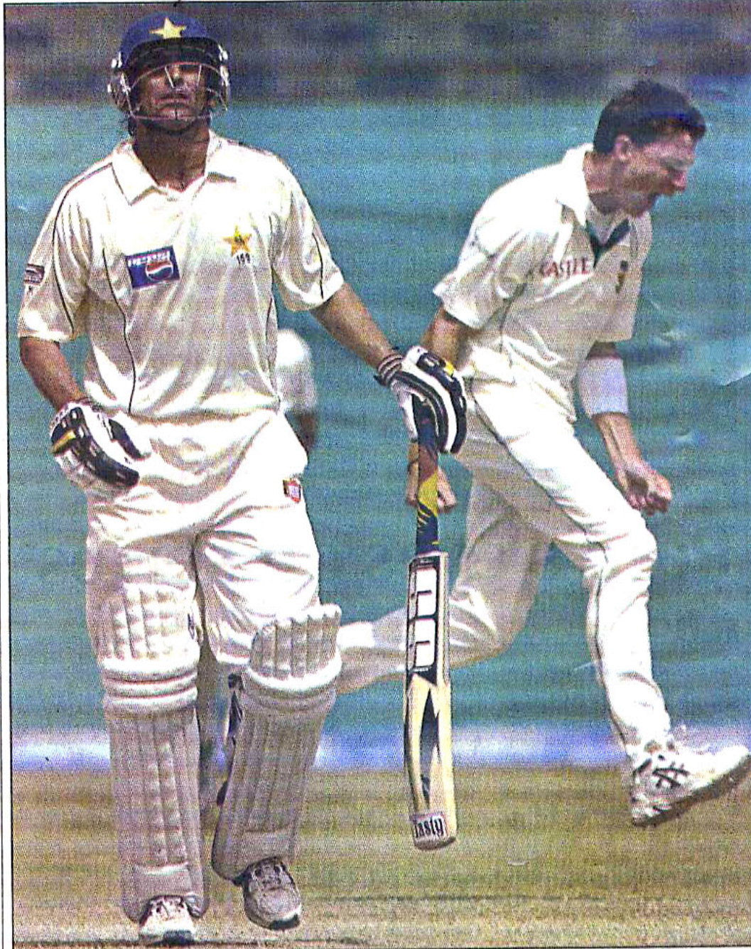
THERE GOES THE CHASE: Pakistan's centurion Younis Khan (L) is removed by an ecstatic South African fast bowler Dale Steyn during the final day's play of the first Test at the Karachi National Stadium on Friday.