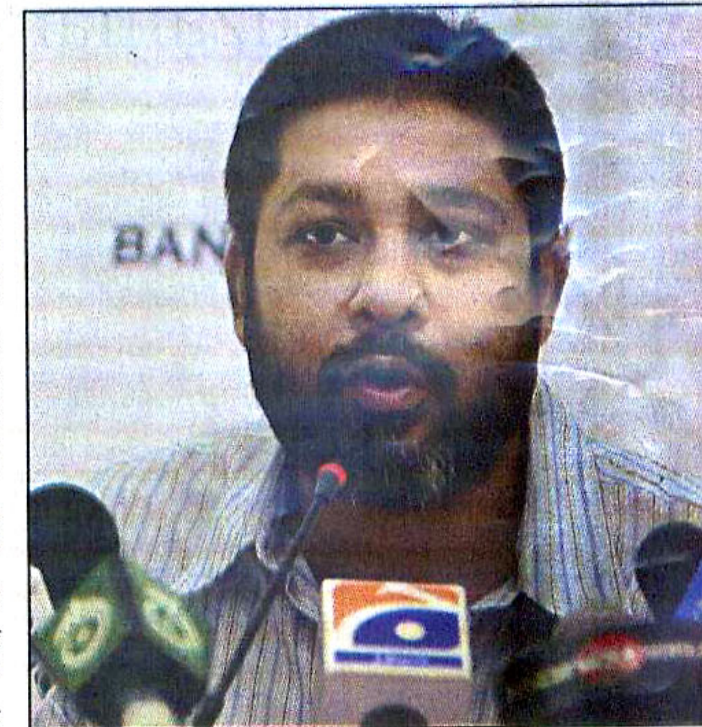
THANK YOU INZY: Pakistan great Inzamam-ul Haq announces his retirement from Test cricket at a press conference in Karachi on Friday.