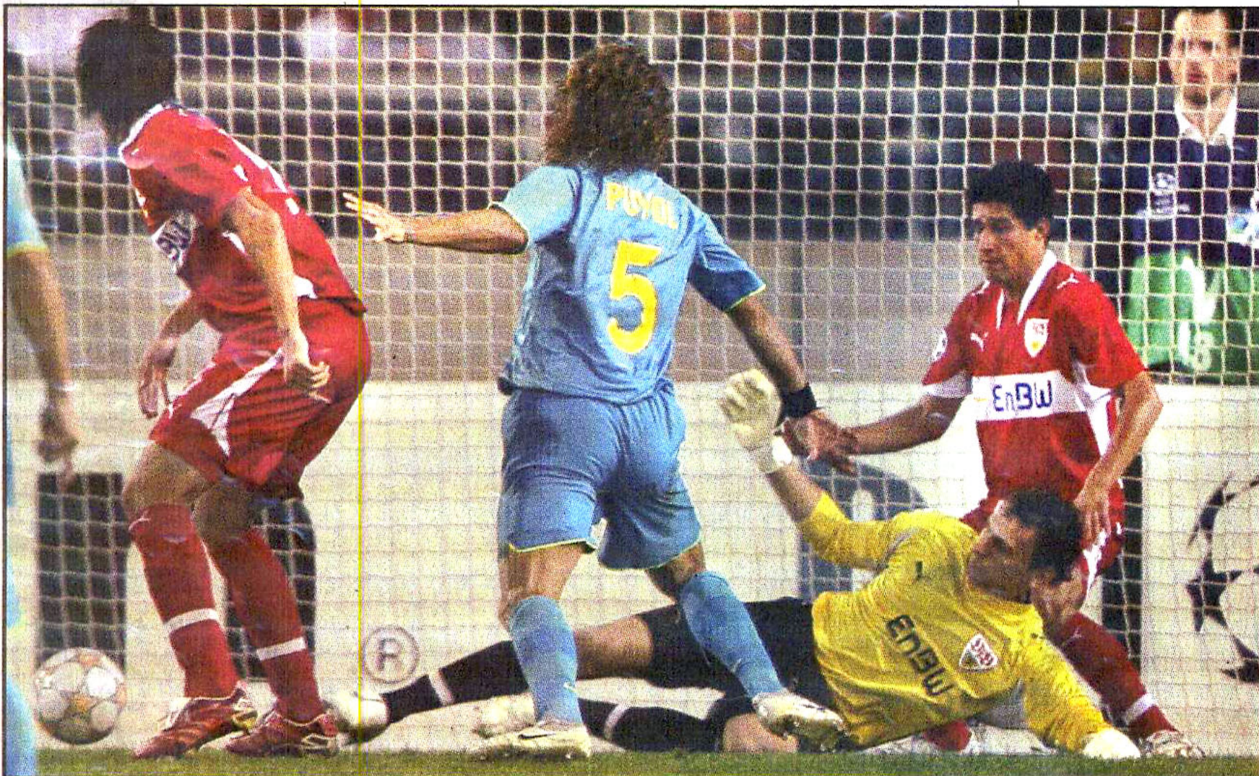
Barcelona captain Carles Puyol (C) scores the first goal against Stuttgart during their Champions League match in Stuttgart on Tuesday.