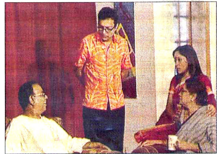
A scene from Pratichchhaya