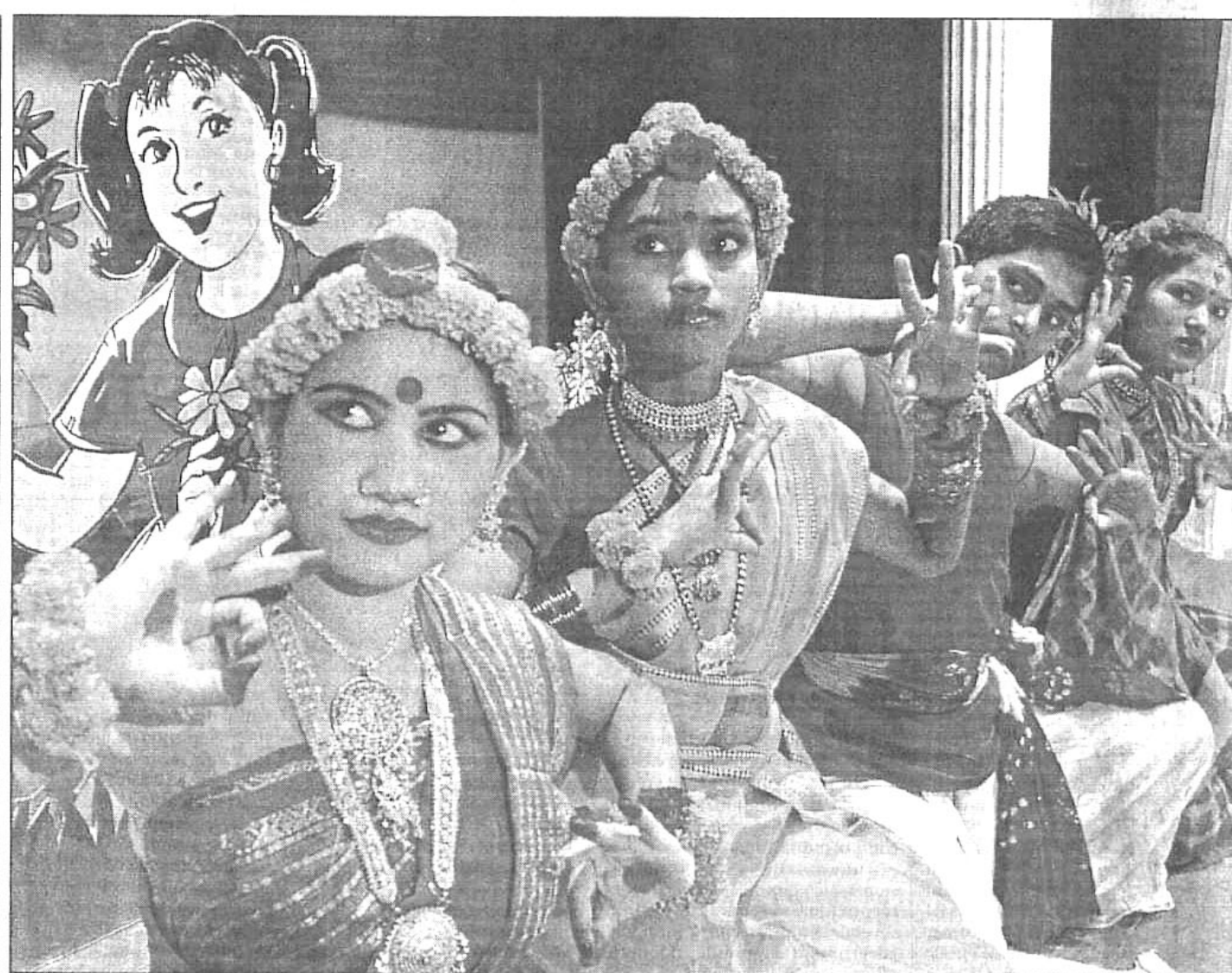
Child artistes perform at a cultural function organised by Shishu Odhikar Forum on the occasion of Child Rights Week at Shishu Academy in the city yesterday.