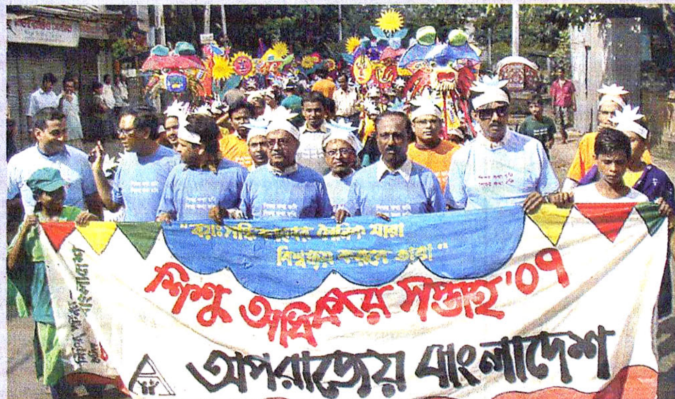
Aparjoo Bangladesh, a non-government organisation, takes out a colourful procession, marking the Child Rights Week '07 on Saturday.

Yusuf Chowdhury passed away in Saudi Arabia on September 9 while performing Umrah.