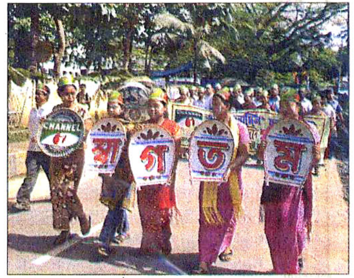
'Amra Channel i Darshok' brought out a rally in Khagrachhari

Discussions also expected that Channel i will play a key role in broadcasting programmes that highlight the heritages of the 12 local ethnic communities of Chittagong Hill Tracts.