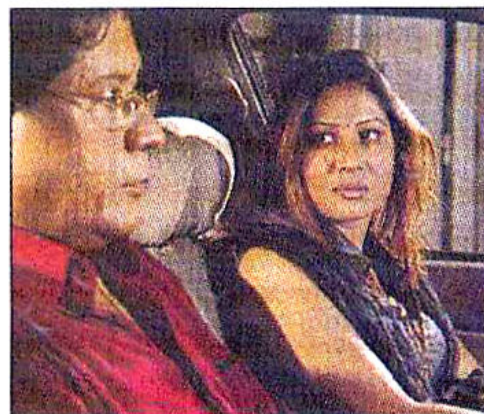
Ei Shob Ondhokar