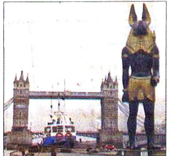
The golden Anubis passes under Tower Bridge in London protected them on their journey.

Organisers said the presence of the 5.6-ton black-and-gold statue was a nod to ancient Egyptian belief that Anubis escorted the dead to the underworld and