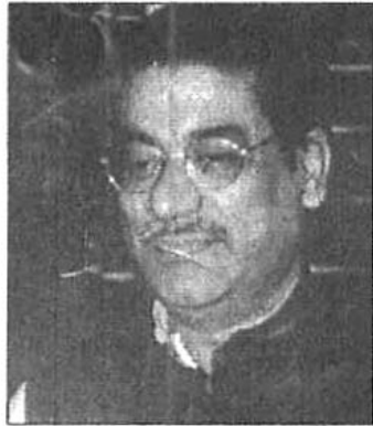
before the special tribunal in the five days.