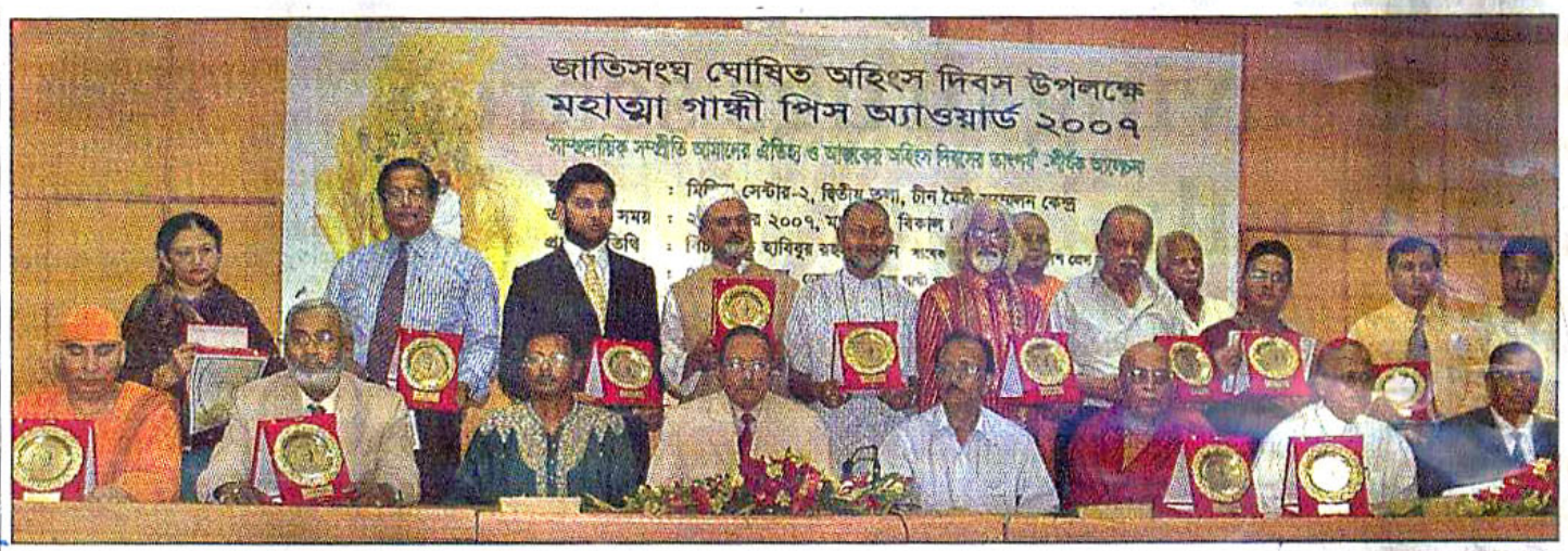
Recipients of Mahatma Gandhi Peace Award-2007 pose for photograph with the guests at Bangladesh-China Friendship Conference Centre in the city yesterday.

"Every woman deserves to live with honour and dignity and every child deserves a good start in life," she said hoping that greater empowerment of women in society will ultimately lead to the increased well-being of children.