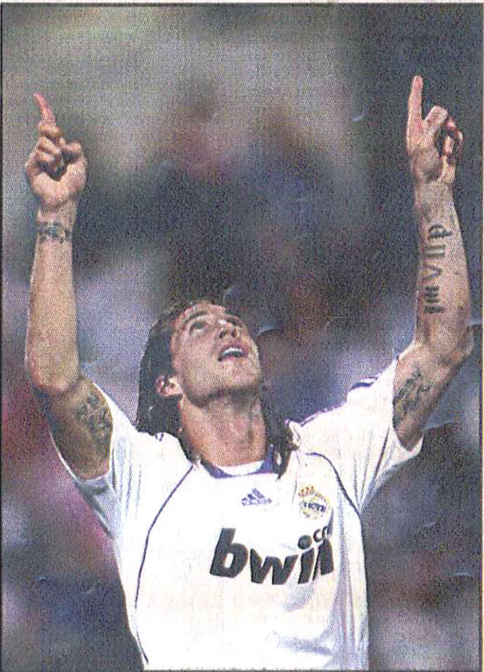
Real Madrid defender Sergio Ramos points to the heavens after scoring the winning goal against Getafe in their Primera Liga clash at the Coliseum Alfonso Perez in Getafe on Sunday.