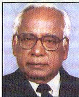
President People's Republic of Bangladesh