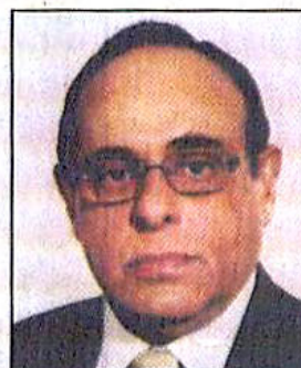
Adviser Ministry of Information Government of the Peoples Republic of Bangladesh