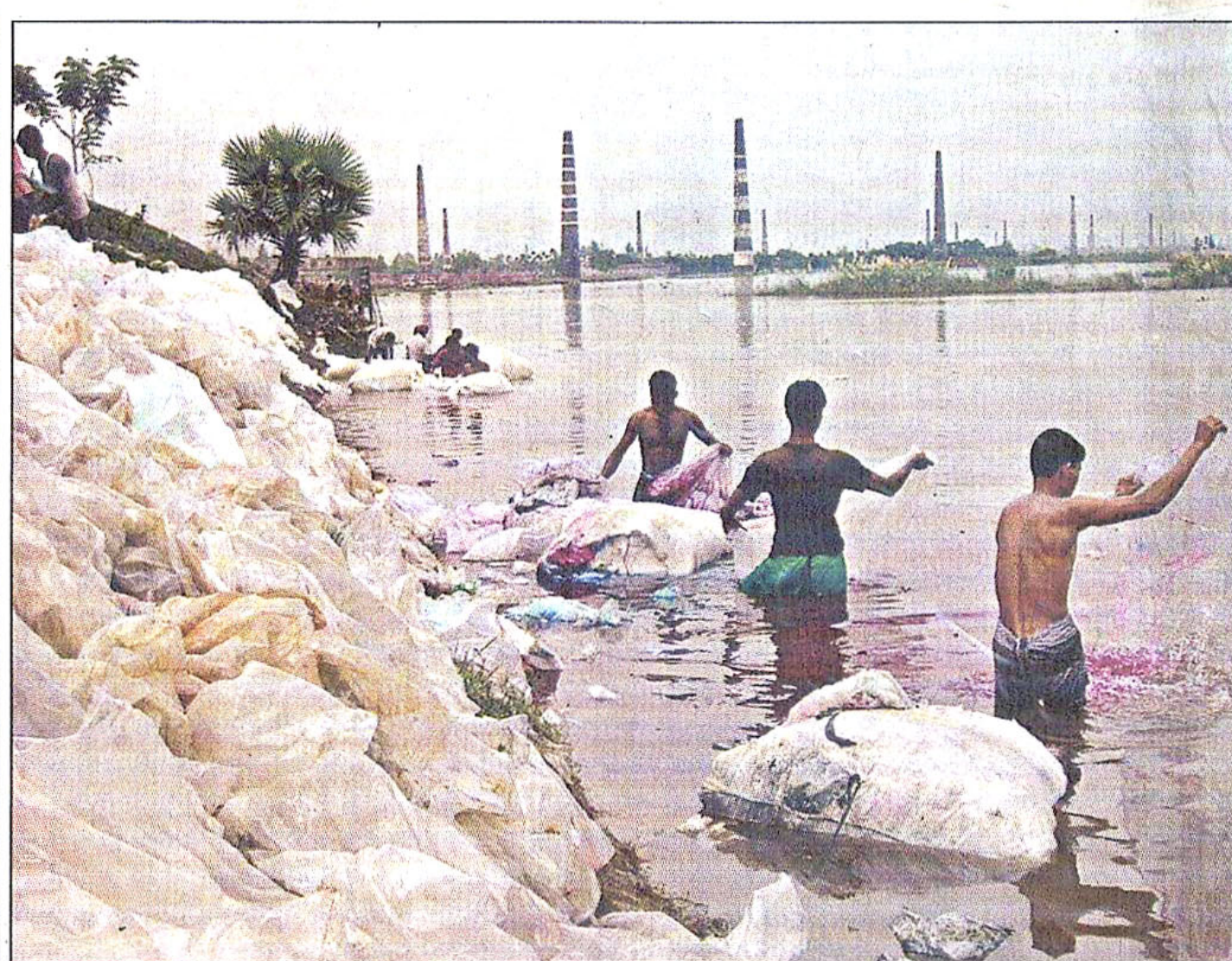
Polythene bags containing chemicals from different factories in Gazipur are washed in the Turag river, perilously adding to its pollution.