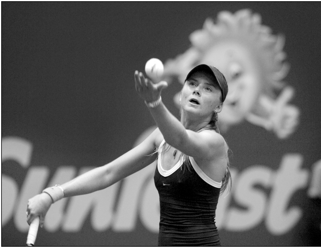
Daniela Hantuchova of Slovakia prepares to serve against Marta Domachowska of Poland at the Sunfeast Open in Kolkata yesterday.

Chinese Emperor Wen-ti executed two foreign chess players after learning that one of the pieces was called 'Emperor'. He was upset that his title of Emperor could be associated with a mere game and forbade the game.