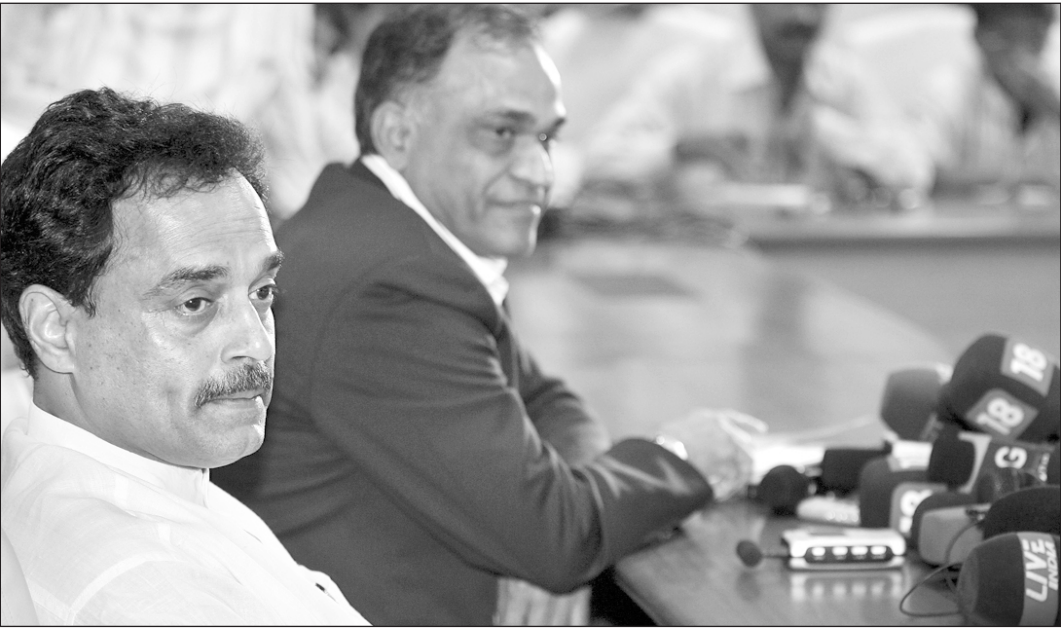
Indian cricket's chief selector Dilip Vengsarkar (L) takes questions from reporters as cricket board secretary Niranjan Shah looks on during a press conference in Mumbai yesterday.

Jol admits his side have to turn their season around starting with the clash against Cypriot side Famagusta. "Our start is the same as last year and to get back on track we need good team work and to cut out the errors sooner rather than later because we don't have the time," he said. "We have to combine our development as a team with getting the right results and that is what we will do."