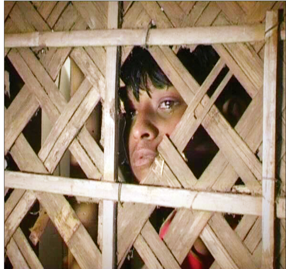
A scene from Banchar Aasha

Science, and considered equivalent to the Oscars. Banchar Aasha will compete in the 'International Academy of Television Arts & Sciences' category, which honours programmes originating