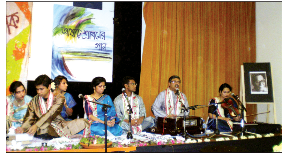
Singers of Shurolok perform at the musical programme