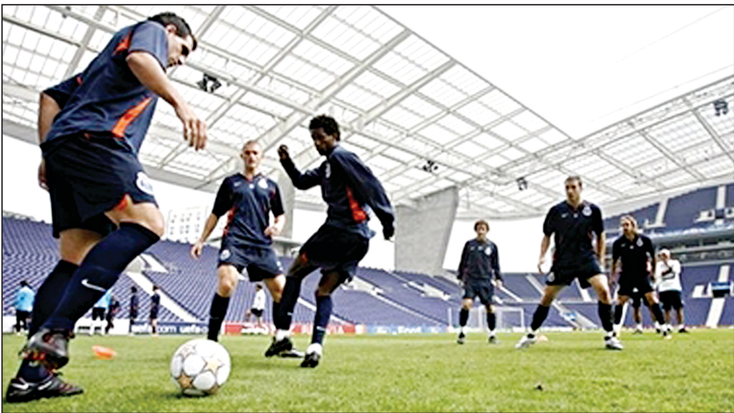
Porto players have a knock-about during a training session at the Dragao Stadium in Lisbon on Monday, a day before they are set to take on defending runners-up Liverpool on the first match day of the Champions League.