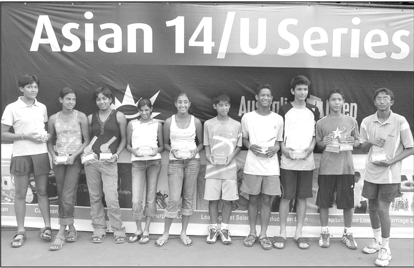
Winners and participants of Prime Bank ATF under-14 tennis tournament pose at the end of the Ramna National Tennis Complex yesterday.