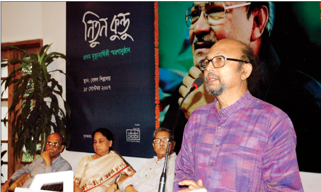
Artist Hashem Khan speaks at the programme

Syed Shamsul Haq, noted litterateur, said, "Whenever I think of Nitun Kundu, I think of enterprise and dream which are two elements which worked within him. He was committed to the culture and history of our country. That dedication seems to be missing now. With his absence, there is a vacuum in our society. As an artist, he was a better sculptor than a painter. It is a pity that in our country the art form, sculpture, has not yet received the kind of appreciation it deserves. After Novera Ahmed the best noted