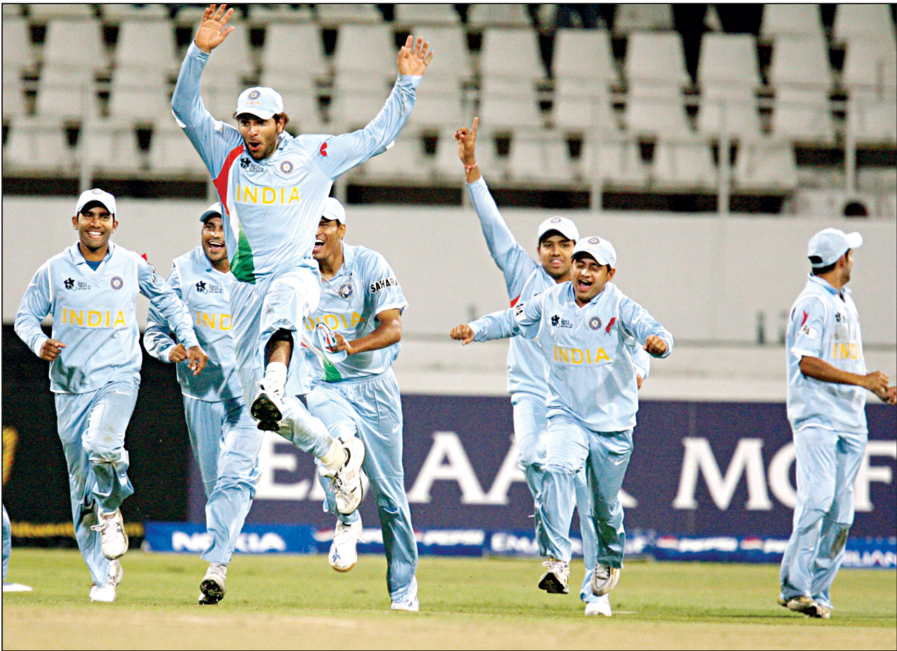
HIP, HIP HOORAY! An airborne Yuvraj Singh leads the Indian celebrations after their side blanked Pakistan in bowl-out in their ICC World Twenty20 Championship match at Kingsmead in Durban on Friday.

Asif used the heavy conditions to wreck India's top order with 4-18, second behind New Zealander Mark Gillespie's 4-7 against Kenya earlier in the week.