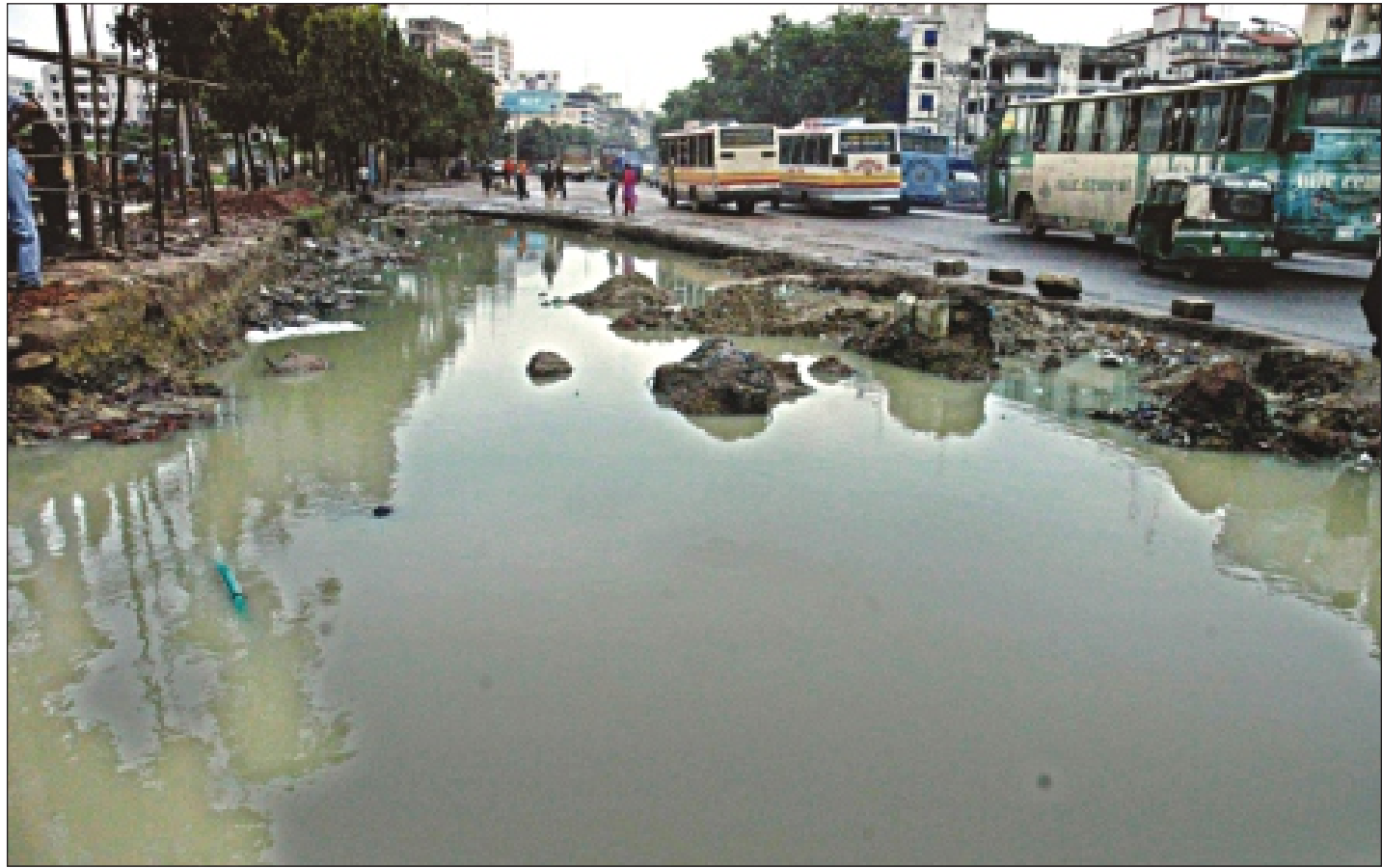
A large puddle on Dhaka-Tongi road at Uttara in the capital poses a hazard to traffic and pedestrians since Roads and Highways Department dug up the road to widen it.

Traders bring in palms to the capital from Gazipur on a boat to reduce transportation costs and to increase their profit. The photo was taken from Nandipara Ghat in Dhaka.