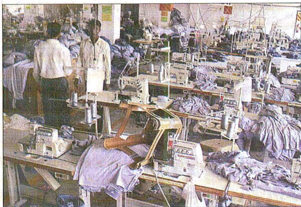
A garment factory vandalised yesterday by agitated workers (left) and an army van guards the entrance to the DEPZ. Most of the units remained shut following fierce clash between police and workers leaving around 100 people injured.