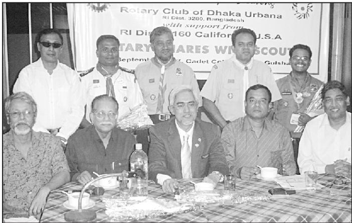
Six top scouts leaders of the country pose for photograph with senior Rotarians of Rotary Club of Dhaka Urbana in the city recently.

A total of 25 representatives from different marginalised communities were given training on different legal issues, including human rights, child marriage, dowry, rape and human trafficking, says a press release. The two-day training programme that ended on Wednesday was organised by Bangladesh Legal Aid and Services Trust (BLAST) and Research Initiatives of Bangladesh (RIB) where people from different indigenous communities, including, Munda, Buno, Kaora, Bede, Shanta, Monipuri and Sweeper attended. They were also given training on issues related to their everyday life like indigenous land distribution, community right and environmental law. RIB has been providing legal assistance to the people after conducting a research on the issue so that the people given legal training would contribute in establishing rights of their respective community people. BLAST will conduct at least four training courses to make the people of the deprived community aware of their rights.