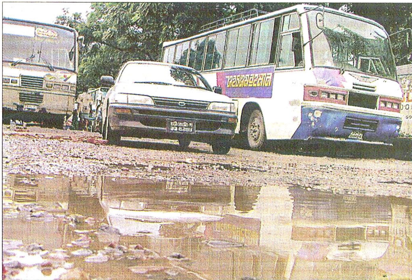
The road in Kadamtali area in the port city lies in a dilapidated condition due to excessive rain, posing danger to the passengers as well as the pedestrians, but the authorities remain indifferent.

"In the proposal we have recommended for repairing the dilapidated centres and constructing new centres", Ruhul Amin added.