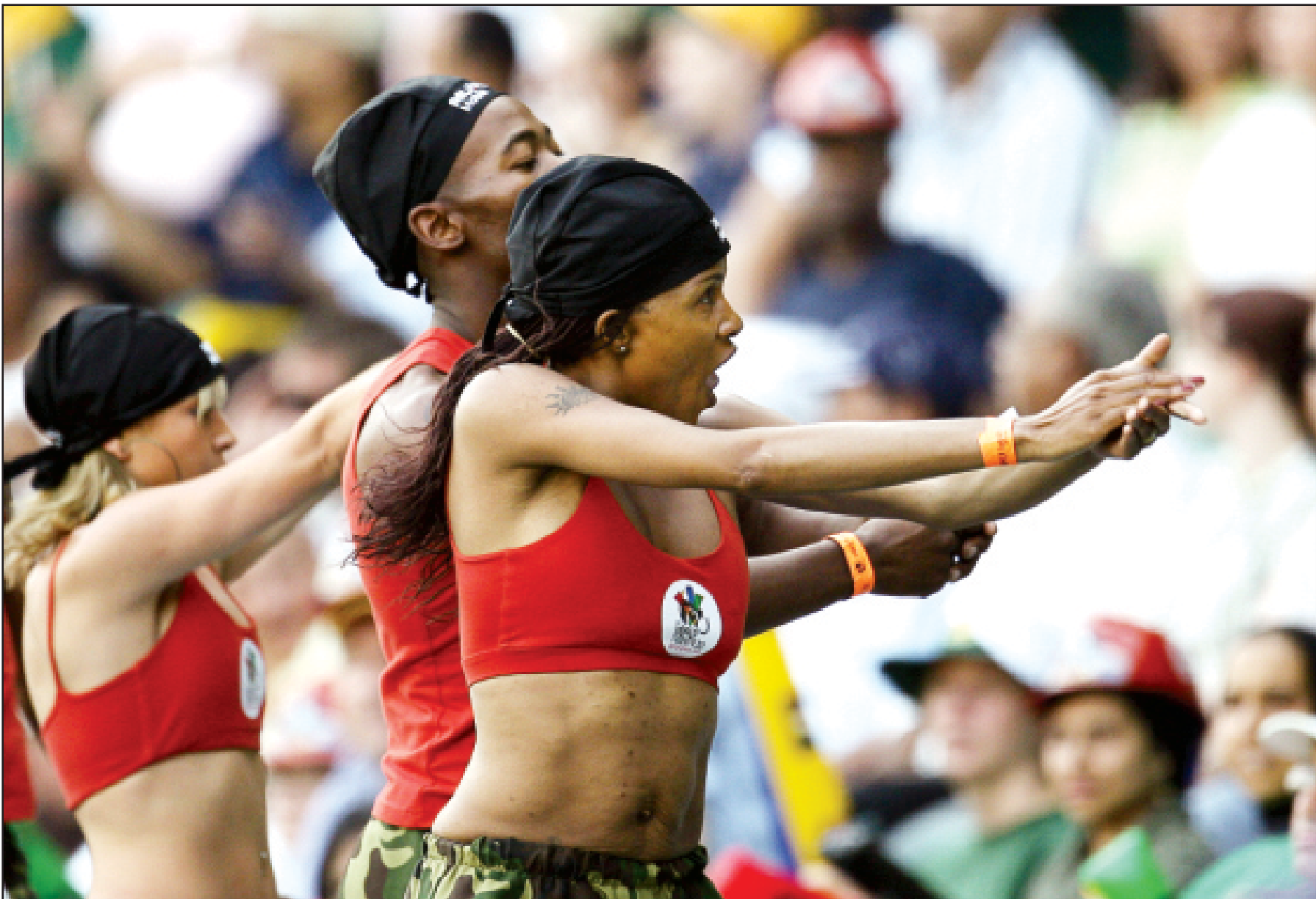
GETTING INTO THE BEAT: Dancers perform during the opening ceremony of the ICC World Twenty20 Championship, the first of its kind, at the Wanderers in Johannesburg yesterday.