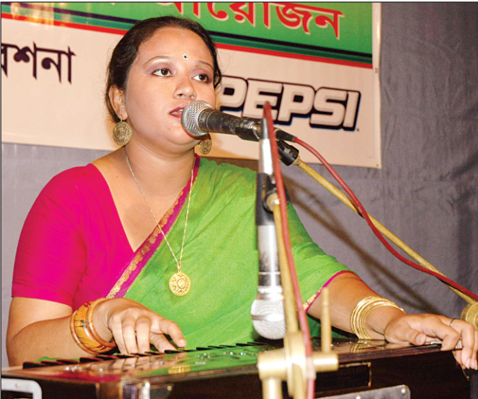
An artiste of Srijon sings at the programme