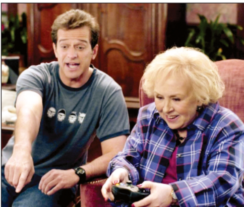
Grandma's Boy On Star Movies at 10:30 pm Genre: Comedy Cast: Doris Roberts, Allen Covert

All programmes are in local time. The Daily Star will not be responsible for any change in the programme.