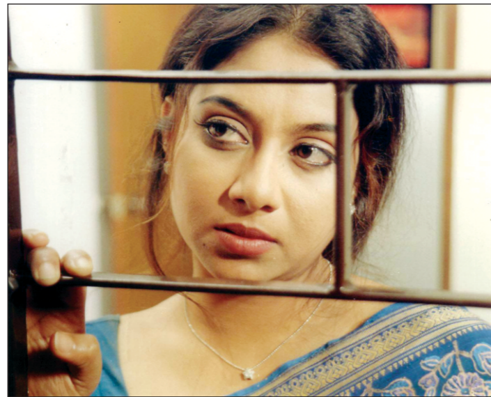
Scenes from Nirontor and Swapnodanay

Discussants critically analyse Bangladeshi filmdom