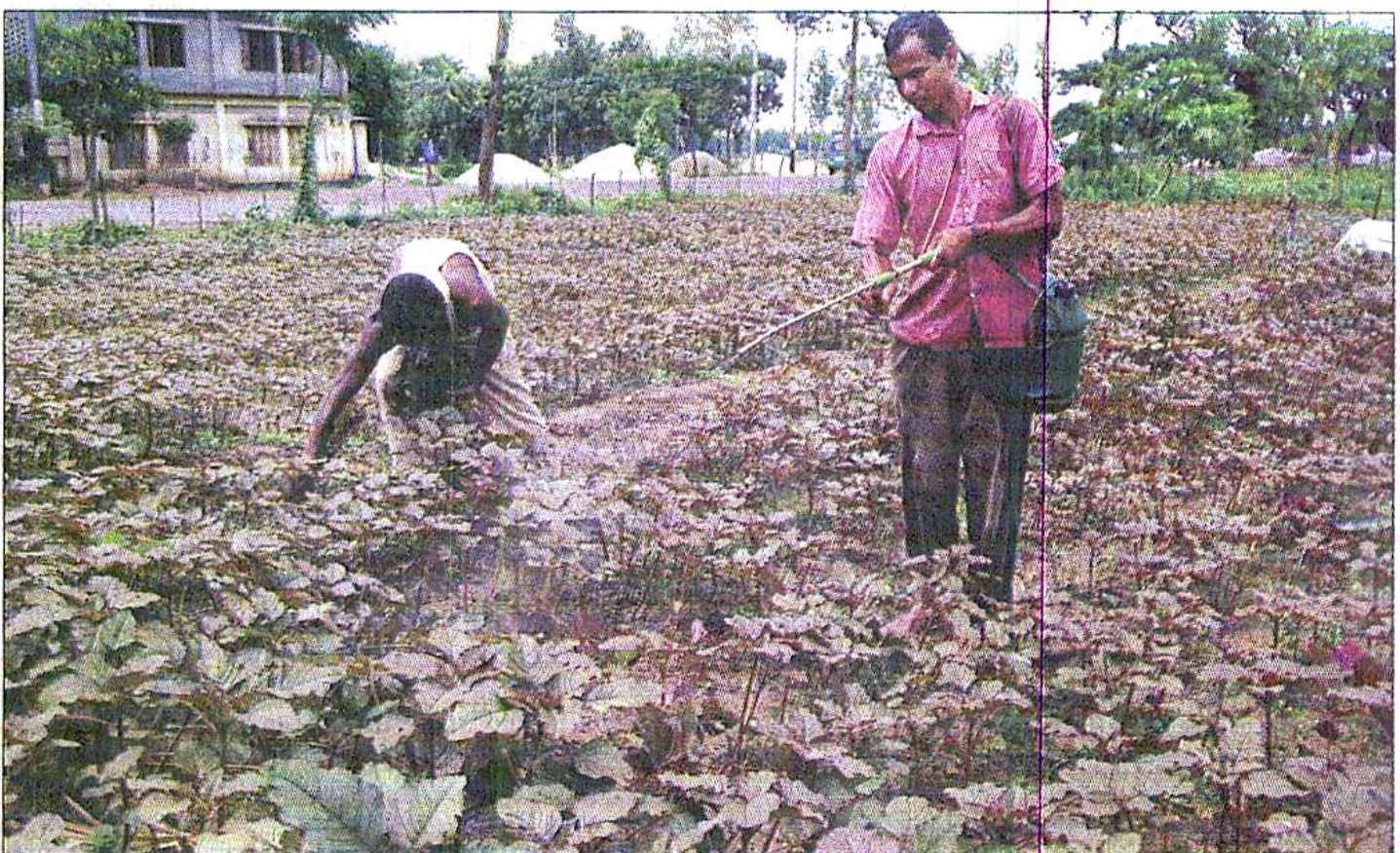
A farmer collects vegetables from the same field while his companion sprays insecticide at Phultala in Shahjahanpur upazila under Bogra district yesterday, unaware of the health hazards such vegetables cause to consumers.