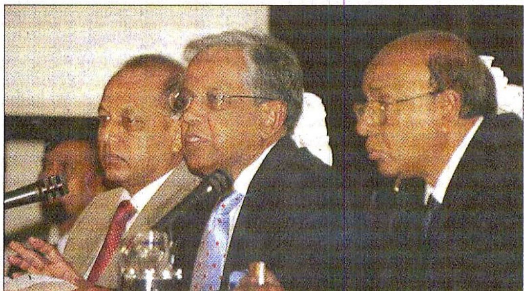
Chief Adviser Fakhruddin Ahmed answering questions from the audience at a dialogue on "Bangladesh Economic Strategies and Priorities" at a city hotel yesterday. Finance Adviser Mirza Azizul Islam, right, and Army chief Moeen U Ahmed, left, are also seen.