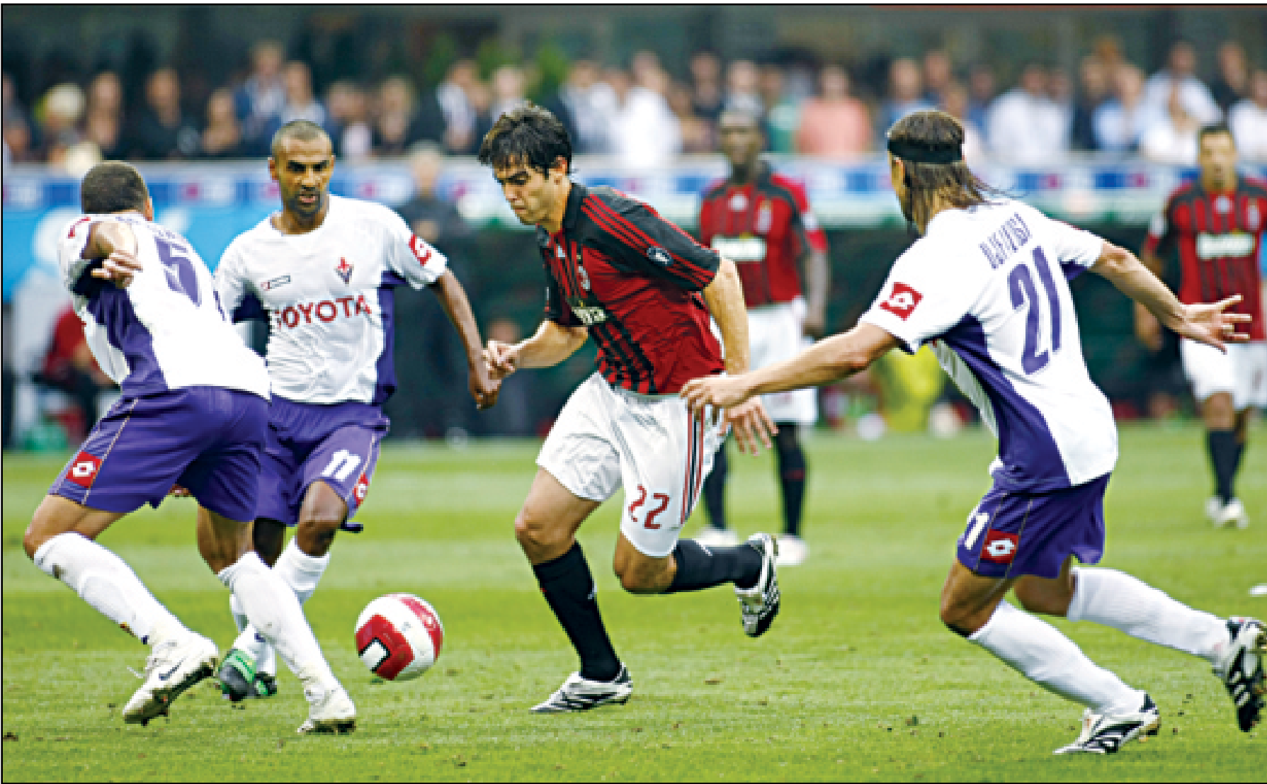
Milan's star midfielder Kaka (C) is surrounded by Fiorentina players during their Serie A clash at the San Siro in Milan on Monday.

"He gives extra value to the squad, has class and character," added Prandelli of Mutu. "He has great vision and we are very happy to have him here. I hope he repeats the wonderful things he did last season, although in my view he can do even better."