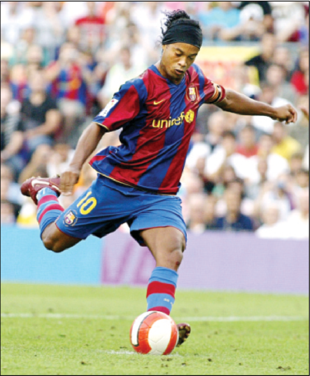
Barcelona's Brazilian star Ronaldinho takes a penalty to score his second goal against Athletic de Bilbao during Sunday's Spanish league match at the Camp Nou Stadium in Barcelona.

Barca could have scored many more but another stylish performance, following the 5-0 demolition of Italian champions Inter Milan on Wednesday, will encourage their fans and coach alike.