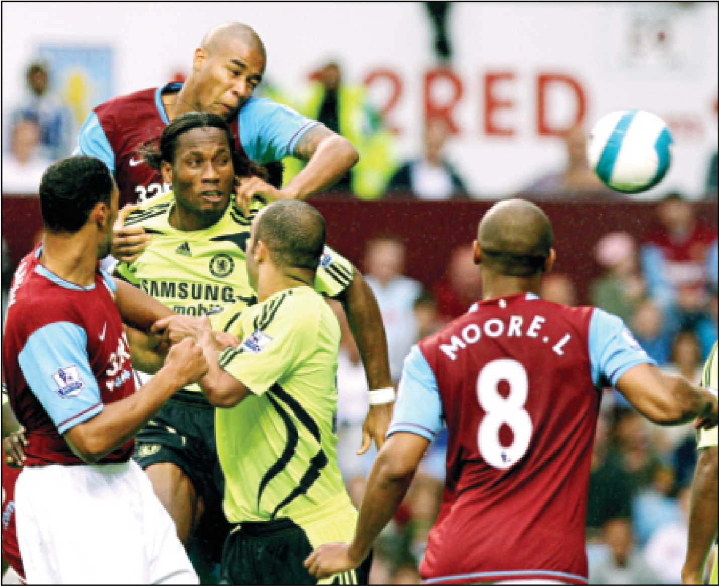
BREAKING THE CHELSEA HEARTS: Aston Villa's Zat Knight (top) leaps above Chelsea striker Didier Drogba to head home during Sunday's Premiership match at Villa Park, Birmingham.