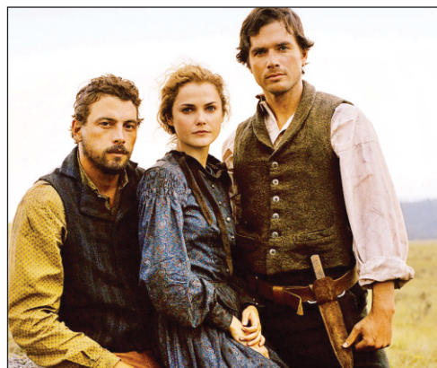
Into the West

On Star Movies at 5:15pm Genre: Adventure/ Drama