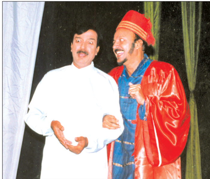
Actors of Natyachakra in Bhoddornok