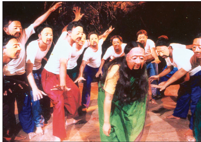
A scene from Bou Bashonti