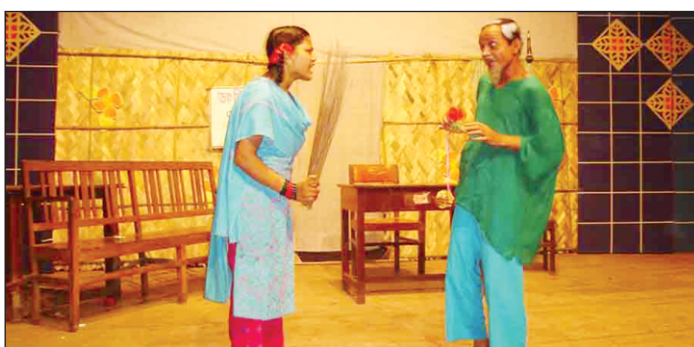
At a week-long theatre festival held at Comilla, Choukosh Natya Sampraday staged Ei Chhilo Kopaley recently