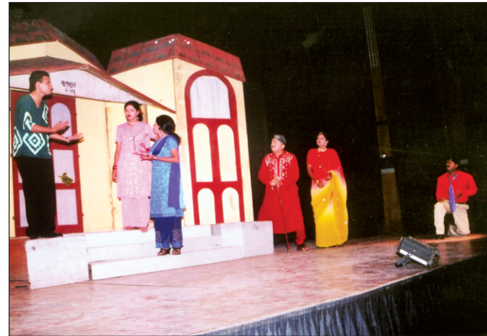
Actors of Dhaka Theatre Mancho in Ghar Jamai