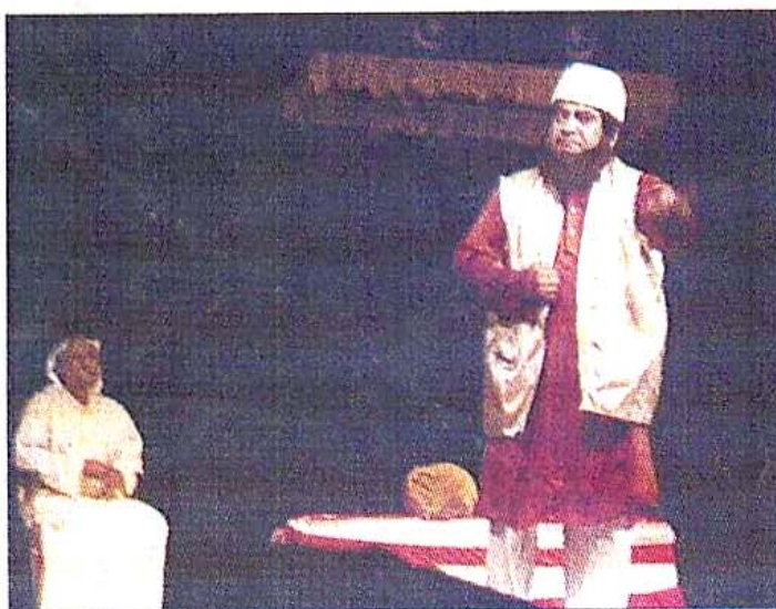
A scene from Meraj Fakirer Maa

Meraj Fakirer Maa , written and directed by Abdullah Al Mamun, is a satire on the tendency of the fanatics, who twist the religious doctrines for their own benefit. The play also highlights a debate between fundamentalism and progressiveness. Meraj Fakirer Maa raises questions like 'should one's religious beliefs compel one to disown his/her mother'.