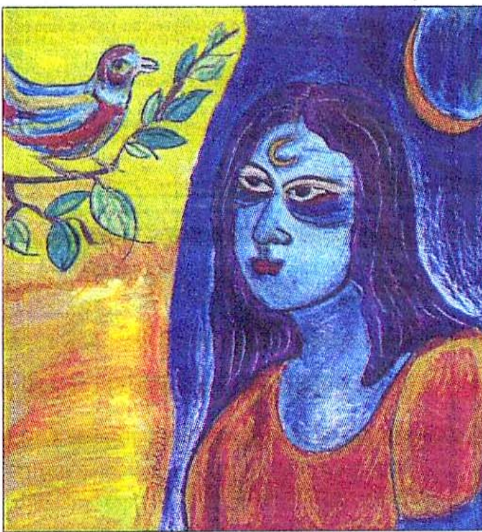
Artwork by Ifat Ara Dewan and Rajeshwari Priyaranjini

brings in as her subjects are from her garden such as aparajita and dolanchampa . The lily has been put in a Jaipuri vase while the background is grey. The other paintings are in acrylic. The gypsy flowers and agnishikha add to the range of subjects. There are projections of her garden. Some landscapes of a rainy day have been included too.