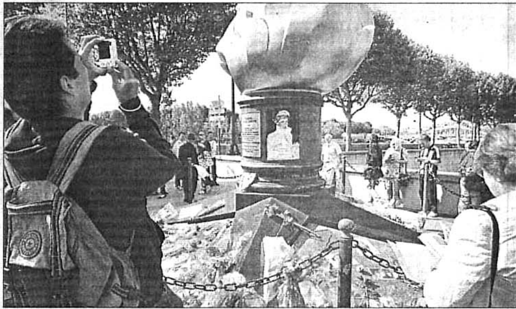
A handful of Diana fans gather yesterday at the Paris site where the princess's car crashed 10 years ago. The Alma tunnel, on the north bank of the River Seine, is a must-see spot for tourists who are drawn to the site where the 36-year-old Diana crashed shortly after midnight on August 31, 1997.