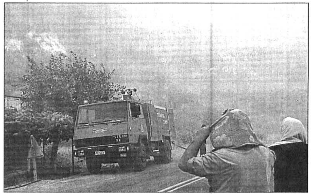
Locals look at firemen trying to extinguish the fire in Kato Kotyli village in central Peloponnese on Thursday. The fires that wrought a trail of destruction across Greece for a week were mostly under control as people counted the cost of a disaster that has claimed 63 lives.

Further north in the Peloponnese, four planes were swooping low over burning forests to dump water on fires, which had endangered nearby villages on Thursday.