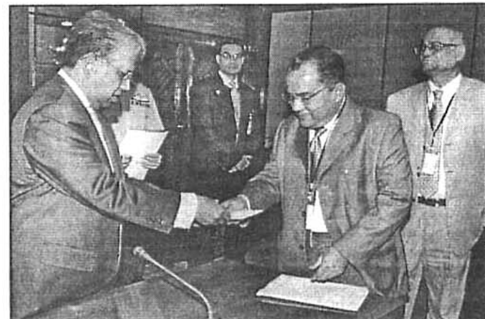
A representative of an organisation hands over a cheque to Chief Adviser Fakhruddin Ahmed at his office yesterday in donations for the flood victims.