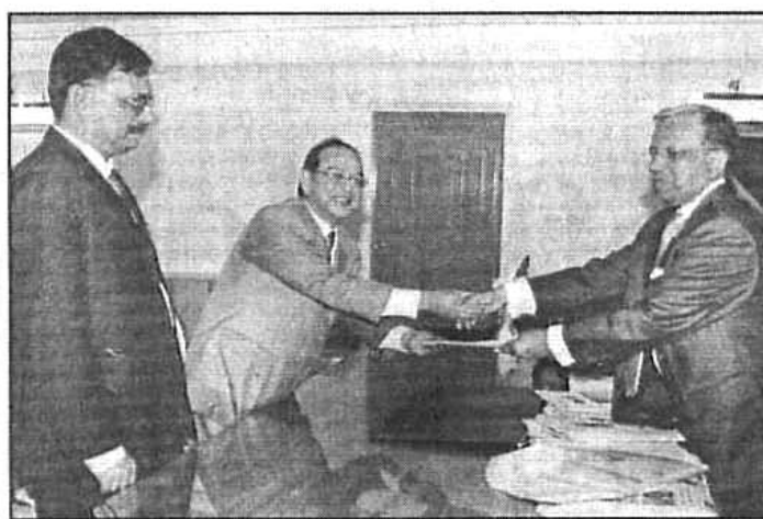
Foreign Adviser Iftekhar Ahmed Chowdhury hands over a cheque amounting to one day's salary of the officials and employees of the foreign ministry to Chief Adviser Fakhruddin Ahmed at his office yesterday for the flood-affected people.

A Rab press release quoting locals said the arrestees were accused in five cases.