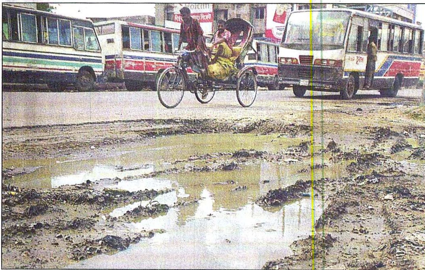
This road at South Jatra Barri in the city has been in a dilapidated state for long, causing suffering to passengers as well as pedestrians.