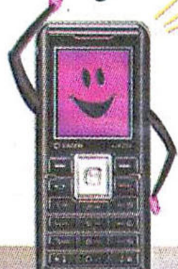
my401X ৳ 6,900