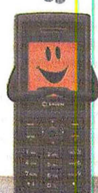
my213X ৳ 2,390