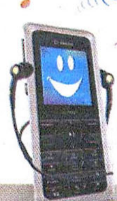
my700X ৳ 12,800