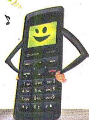
my202X ৳ 2,390